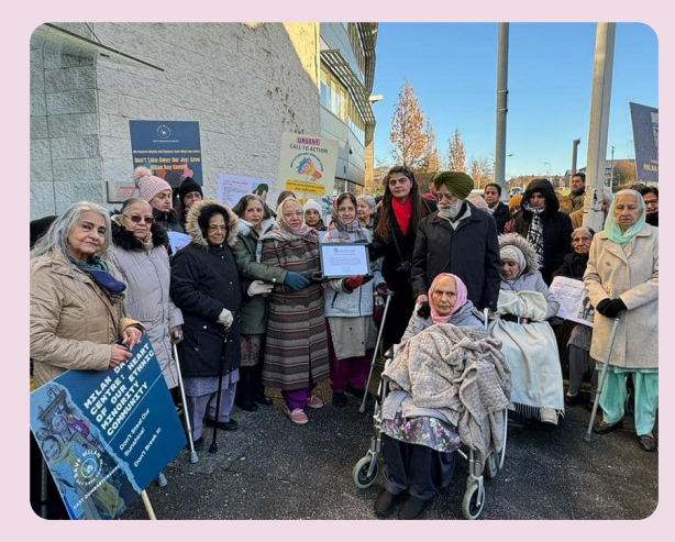
Milan Day Care Centre.

Campaigned with ethnic minority older people in East Dunbartonshire to save the Milan Day Care Centre.