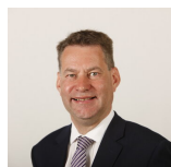
Murdo Fraser Scottish Conservative and Unionist Party