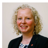
Convener Claire Baker Scottish Labour