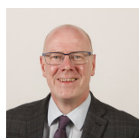
Kevin Stewart Scottish National Party