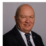
Gordon MacDonald Scottish National Party