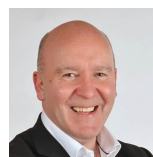
Willie Coffey Scottish National Party