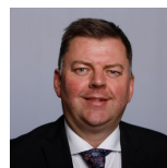
Colin Smyth Scottish Labour