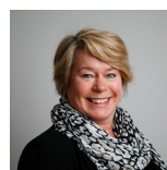
Michelle Thomson Scottish National Party