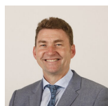
Brian Whittle Scottish Conservative and Unionist Party