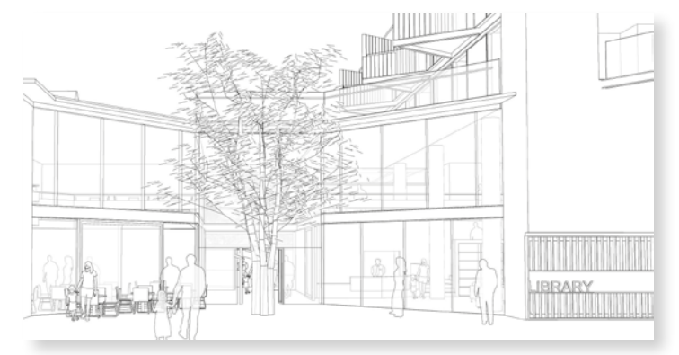
Muirhouse Library with the Learning and Skills Hub and housing above

A big focus for the new library will be working to engage with the new members of the community who have or are moving into the new housing.