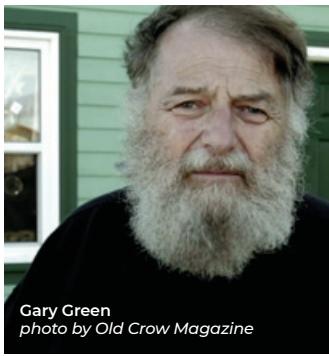
Gary Green