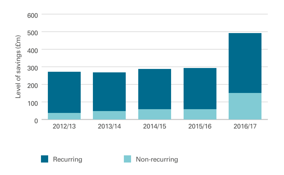
Exhibit 4 Overall level of planned LDP savings by NHS boards between 2012/13 and 2016/17 split by planned recurring and non-recurring The planned use of non-recurring savings has increased over the past five years.