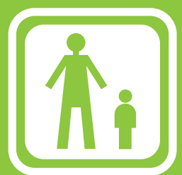
Child Abuse including Child Sexual Exploitation