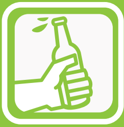
Antisocial Behaviour / Disorder