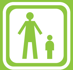
Child Abuse including Child Sexual Exploitation