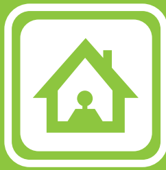
Homes being broken into