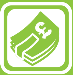
Serious Organised Crime