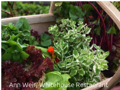
Ann Weir, Whitehouse Restaurant

Let the gardeners tell you their stories, take part in fun - and sometimes educational - activities, and let yourself be inspired by the Power of Food.