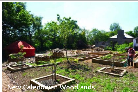
New Caledonian Woodlands

Bus: 8, 23, 27 / Bicycle: space for locking bikes / Car: car parking Fully accessible / Toilets