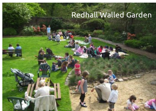
Redhall Walled Garden