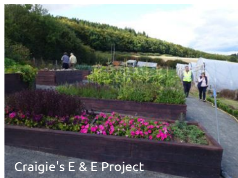
Craigie's E & E Project

Bus: 40, 40A / Bicycle: space for locking bikes / Car: car parking Fully accessible / Toilets