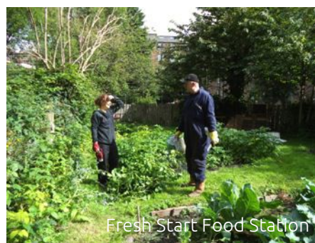
Fresh Start Food Station

Bus: 4, 34, 35, 44(A) to Slateford Rd; or 10, 27 to Polwarth Terrace; or 38 to Ashley Terrace / Bicycle: space for locking bikes Fully accessible / Toilets