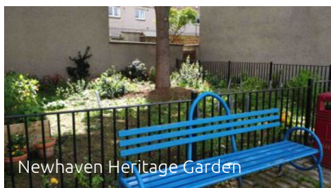
Newhaven Heritage Garden

Bus: 7, 11, 16 / Bicycle: space for locking bikes / Car: car parking Fully accessible