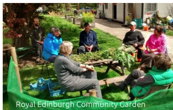
Royal Edinburgh Community Garden

Bus: 8, 23, 27 / Bicycle: space for locking bikes / Car: car parking Fully accessible / Toilets