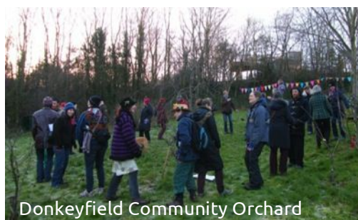
Donkeyfield Community Orchard