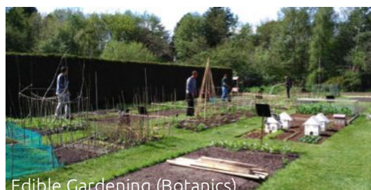
Edible Gardening (Botanics)