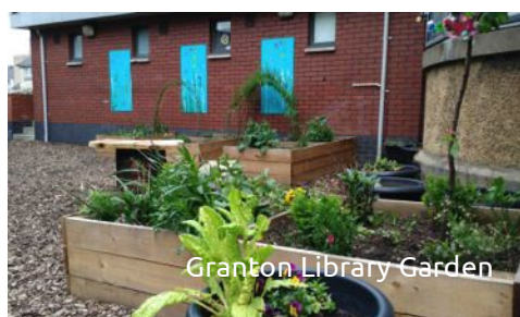
Granton Library Garden

Bus: 44 / Bicycle: Innocent Railway cycle path & space for locking bikes / Car: car parking