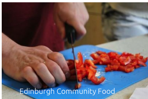
Edinburgh Community Food