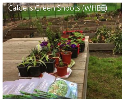
Calders Green Shoots (WHEE)