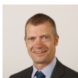
Graham Simpson Scottish Conservative and Unionist Party