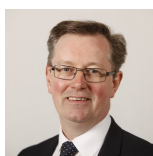
Alexander Stewart Scottish Conservative and Unionist Party